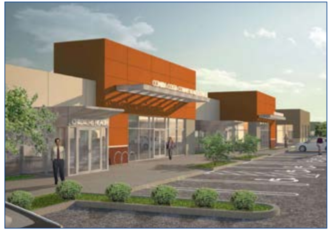
An artist's rendering of what the new Antioch Health Center will look like after it opens at the end of 2015.

Construction has begun on the new Antioch Health Center, which is expected to open at the end of 2015 or early next year. The new facility will be located at 2335 Country Hills Drive, about two-and-a-half miles from the current health center in Antioch. Service capacity will be significantly expanded in the new building. As part of the department's ongoing efforts to integrate behavioral and physical healthcare, the facility will also serve as the new site for children's behavioral health services in Antioch. Ambulatory care and Behavioral Health staff have been closely involved in the facility's design, which incorporates the latest approaches to ambulatory healthcare delivery, using architecture to facilitate teamwork and efficient patient flow.