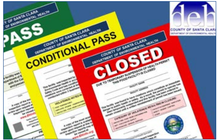
Placards like these from Santa Clara County will soon be appearing in Contra Costa restaurants.

For more information about the ordinance and to find resources on how to quit smoking, visit smokefreecc.org .