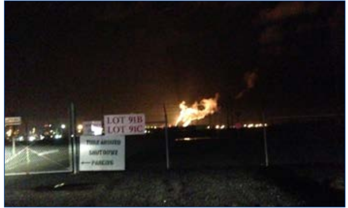
The December 18 flaring incident at the Chevron refinery generated community concern.

For more information about school-based clinics, visit cchealth.org/school-based-clinic .