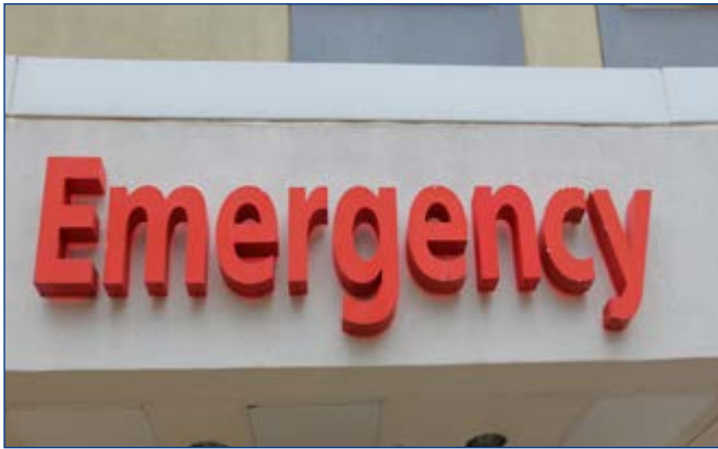
The planned expansion of the Emergency Department includes adding five treatment areas.