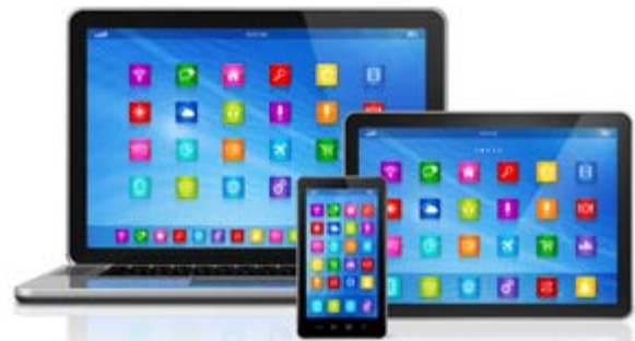
The new in-person service will offer staff technical advice and support for computers and mobile devices.

Starting February 2, Health Services employees will be able to get free in-person technological help at a new walk-up service desk in the main lobby of Contra Costa Regional Medical Center (CCRMC). The walk-up desk, which will be managed and staffed by our Information Technology unit, will offer staff advice and support for computers and mobile devices. This new in-person service is another way for users to keep their technology in good working order and will supplement IT's phone-based support service. Examples of services to be offered include: basic hardware repair, software support, limited ccLink support, help with CCHS mobile applications and technology education. The walk-up desk will be open 9 a.m. to 4 p.m. (except for the noon lunch hour), Monday through Friday.